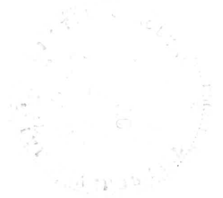
EXHIBIT A PUBLIC HEARING MATERIALS